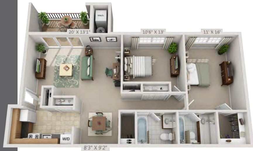
B2: 2 Bedroom/2 Bath • 975 sq ft