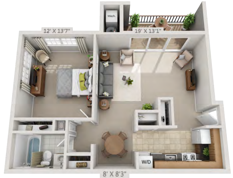
A1: 1 Bedroom/1 Bath • 690 sq ft